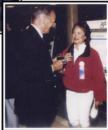
William Steinkraus and Margie Goldstein-Engle